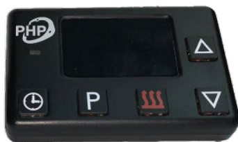
PHP Operating Switch PN: P65D-X301

Depending upon your application you may also consider these items: